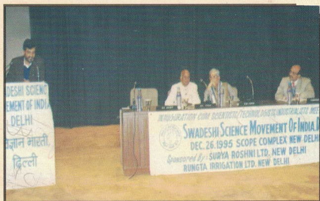
Dr. Murli Manohar Joshi, Hon'ble M.P. (Rajya Sabha) & Chairman, Parliamentary Standing Committee on Commerce presiding the function of the launching of the forum during 1995

science and innovate in a formal way, towards making Bharat innovative and a global leader in sustainable technologies through a major drive of an integrated outreach for R & D - National Innovation System.